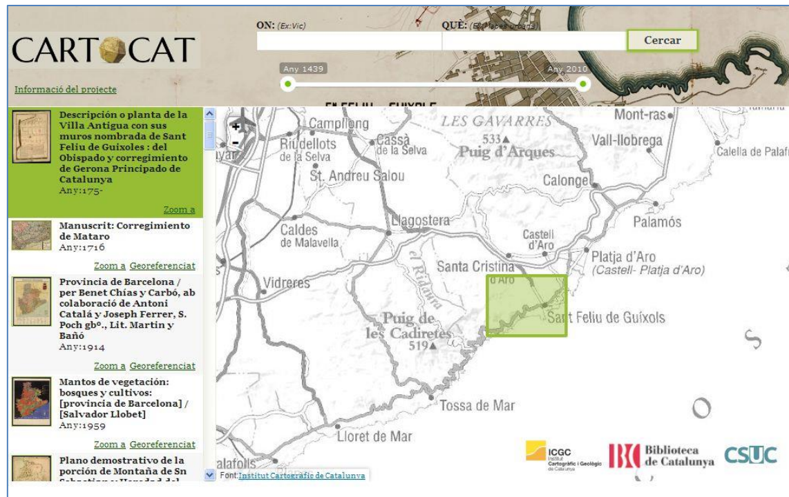
Figure 5 The Cartocat portal created to browse the objects described in the SDI metadata catalog

Providing more elaborated tools to patrons and users results in better understanding of its' usage, which in turn means farther reaching diffusion and thus, we hope, much higher reuse of this type of cartographic heritage materials.