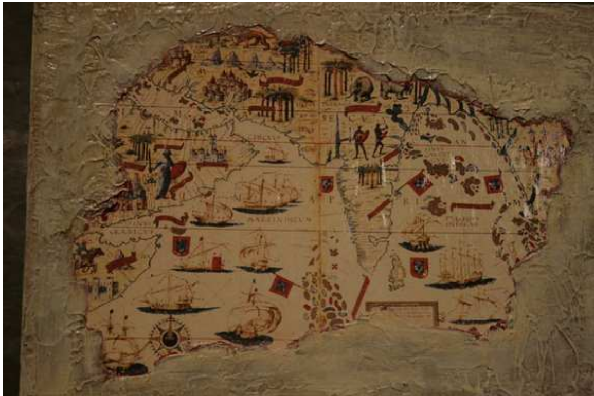
Figure 2: From the display of Manuela Mourao (USA): early-modern portuguese maps

(Österreich), Nasrine Seraji (Frankreich), Hosoya Schäfer Architects (Schweiz) as well as of probosics (England) - Urban tapestries.