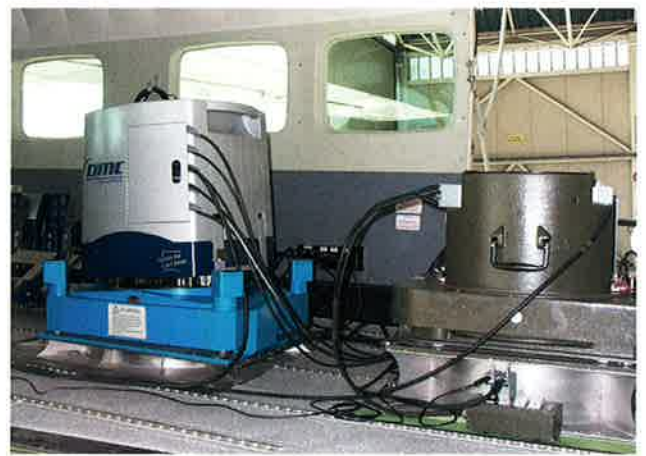
▲ Figure 3, RC30 (right) and DMC (left) cameras mounted in same aircraft.

images 25 blocks were used, flown over areas of urban development. In terms of combined X,Y accuracy, DMC shows a slight improvement compared to analogue cameras, while the vertical component remains the same (Table 3).